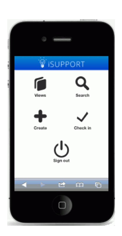
iSupport's smart phone and tablet interfaces